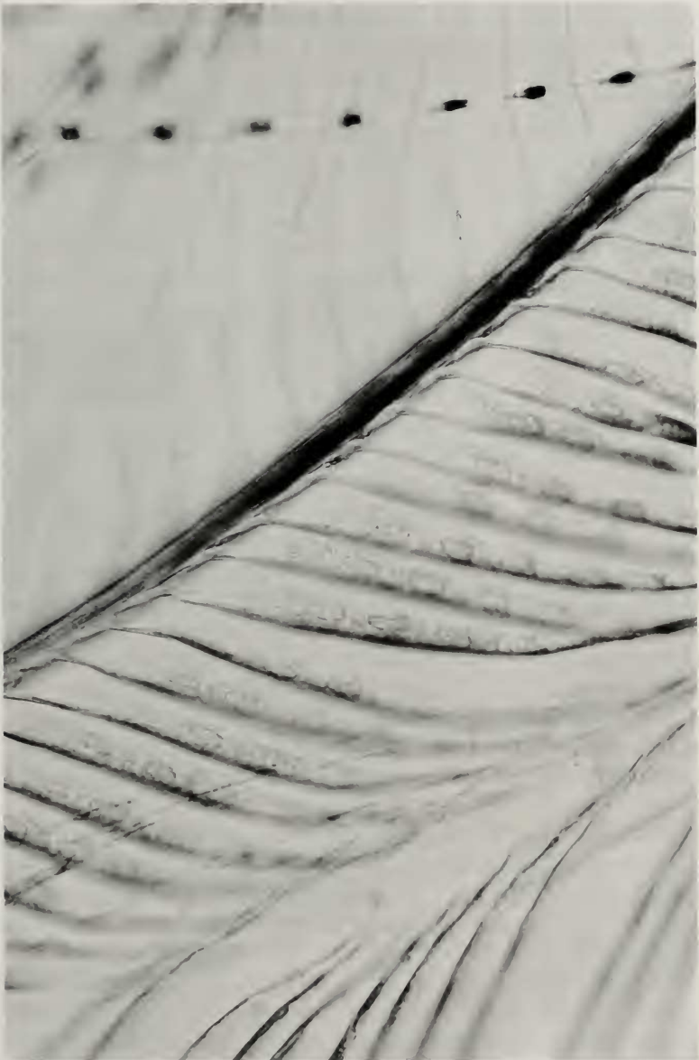
FIG. 5. Photomicrograph (250 \times ) of Antillean Piculet showing pennaceous barbules at base of barbs from a wing covert.